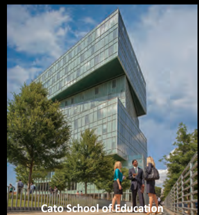
Cato School of Education