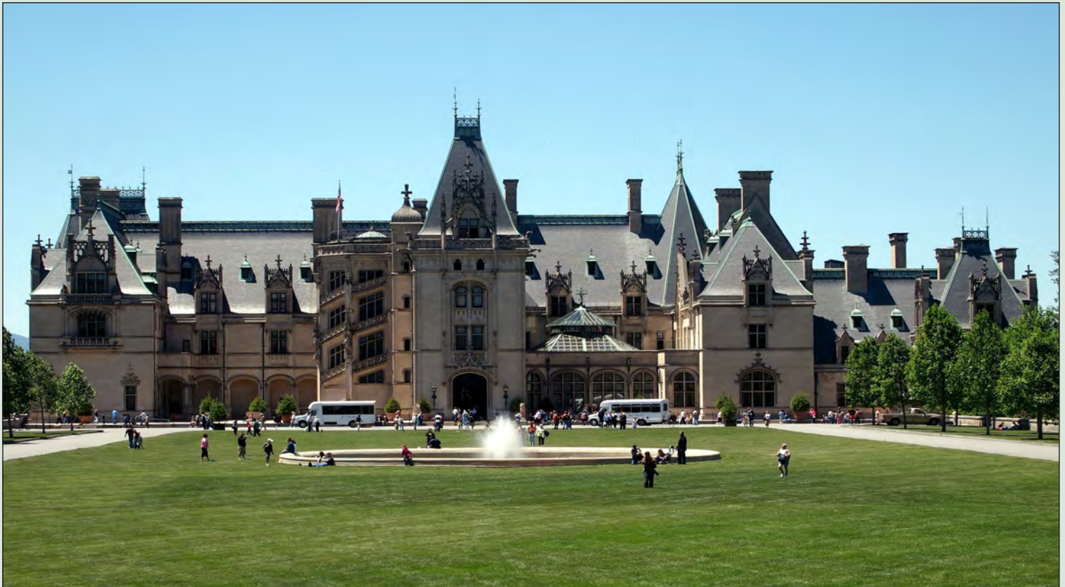
The Biltmore Estate