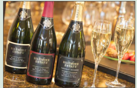
Antler Hill Winery