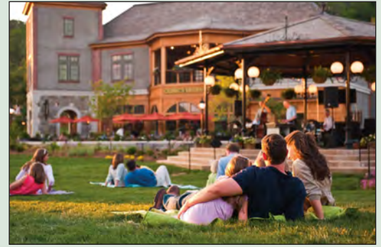
Antler Hill Village