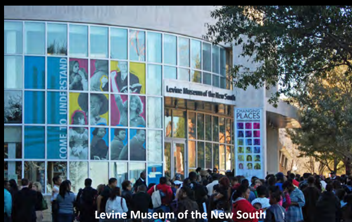
Levine Museum of the New South