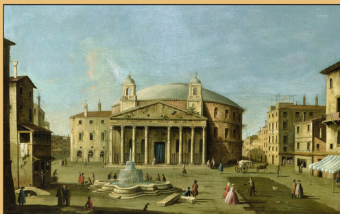
Pantheon Rome c1760