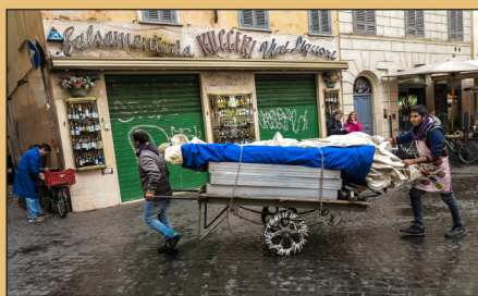
Campo die Fiori