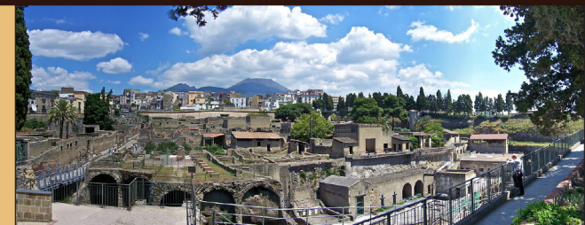
Herculaneum Archaeological Park