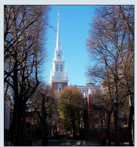
Old North Church