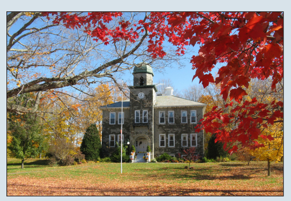
New Salem Academy