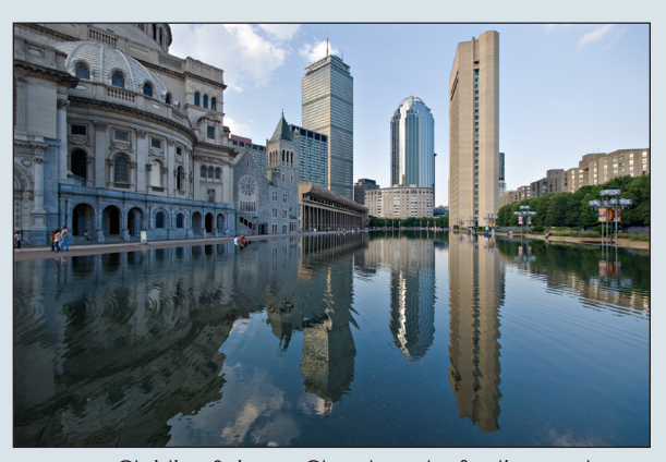
Christian Science Church and reflecting pool