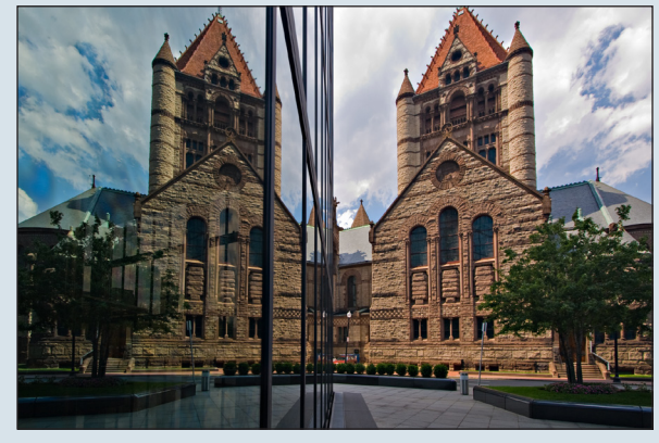
Trinity Church with reflection in John Hancock Tower