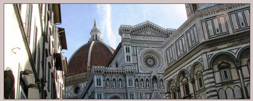
Florence Cathedral (Il Duomo di Firenze)

Classic Aperitivo in Hotel Ambasciatori bar. Included: red and white wine, one cocktail, soft drinks, light snacks