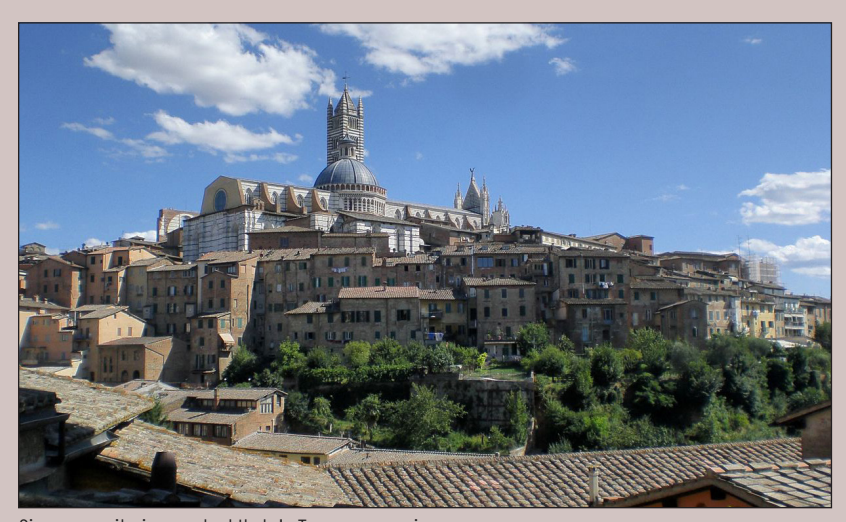
Siena, a city in central Italy's Tuscany region.