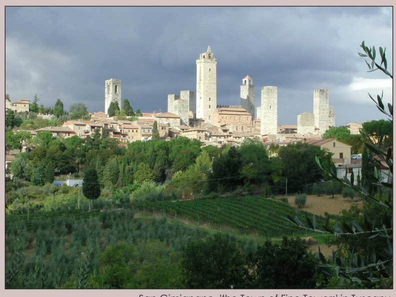
San Gimignano, 'the Town of Fine Towers' in Tuscany.