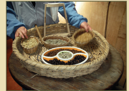
Costa Rican Coffee

Note: All written papers will be considered for publication in a special volume of the International Social Studies Forum, published by Information Age Publishing.