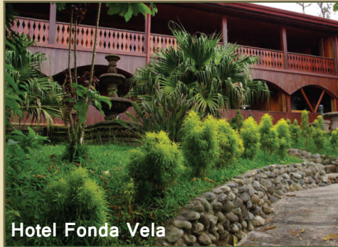
Hotel Fonda Vela

Afternoon: Keynotes on “Impacts of Tourism on Food Security” and “Sustainable Development, Social Justice, and Fair Trade”